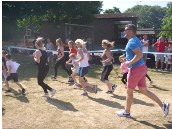
RACE FOR LIFE PHOTOS