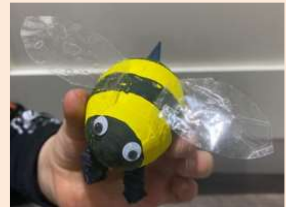
Reception winner - Spencer Collier