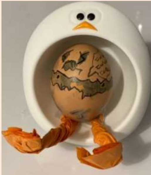
Year 4 winner - Archer Wood